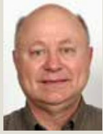
Branson Williams Fuels 35 years, May 3