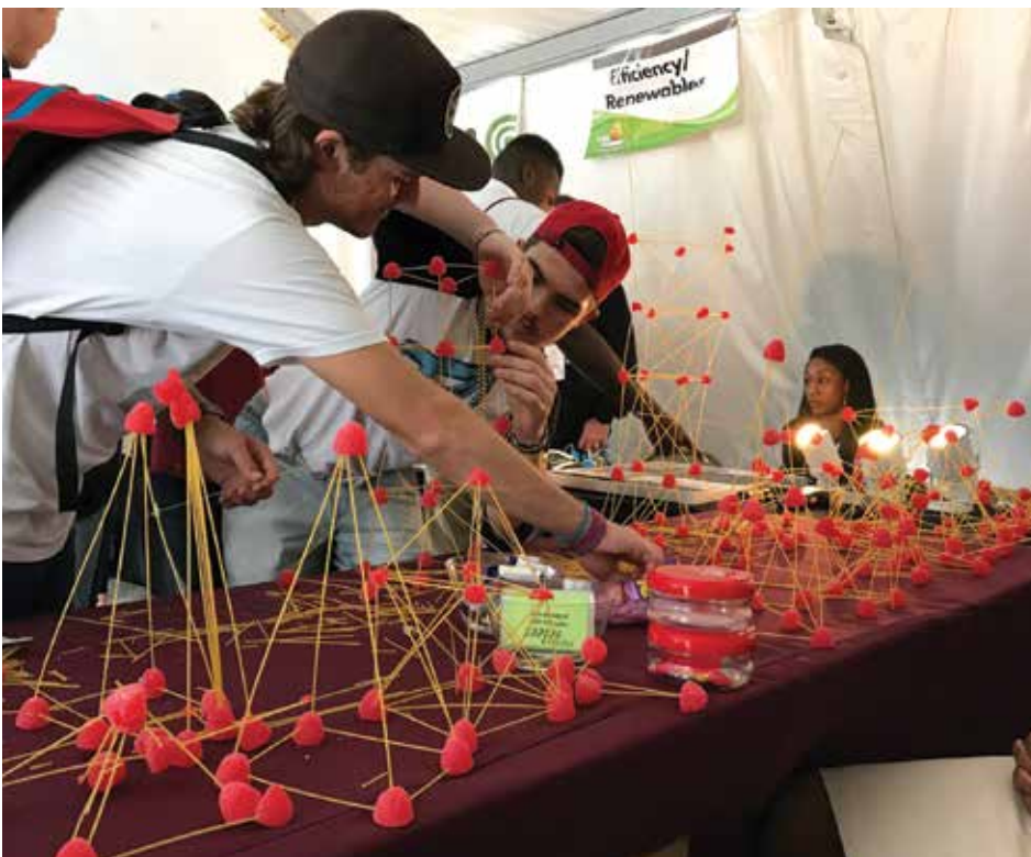
Escambia River EC (EREC) and PowerSouth partnered for the second year at the World of Possibilities and Skills USA expo. More than 3,000 students attended the event at Pensacola State College, where they participated in interactive exhibits demonstrating jobs in the energy industry.